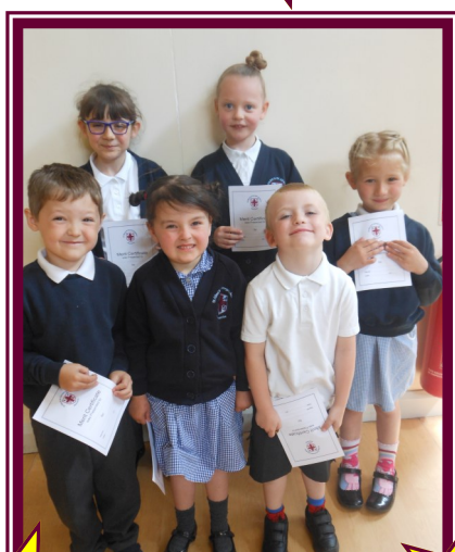
KS1 Star Performers