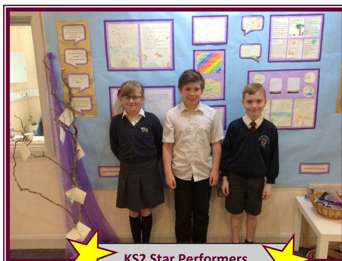
KS2 Star Performers