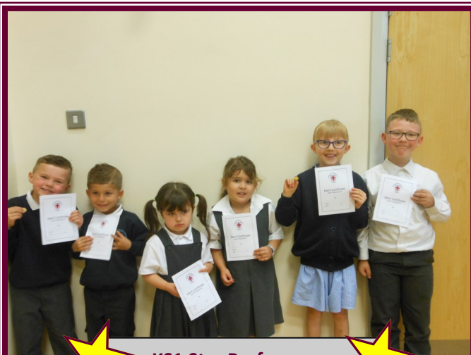
KS1 Star Performers