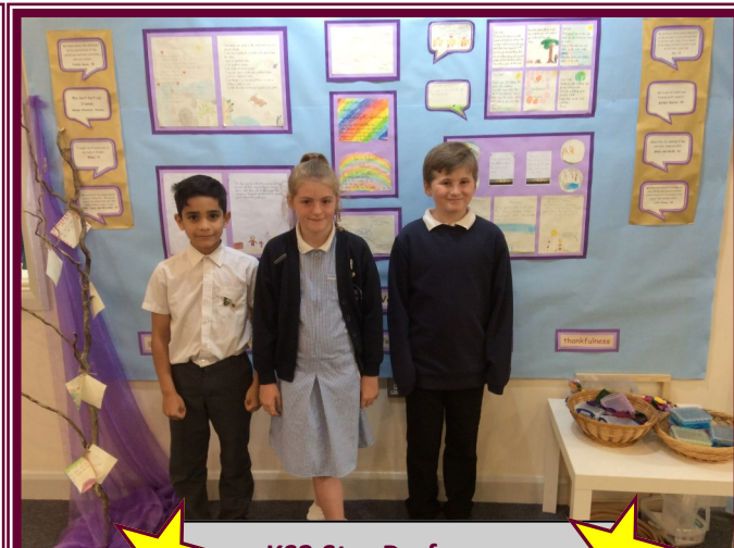
KS2 Star Performers